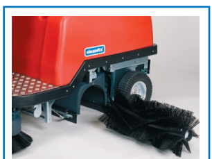
Easy to change the brushes