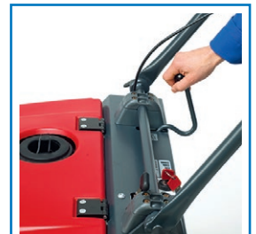
Lever for raising/ lowering side brush