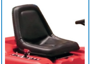
Adjustable ergonomic seat