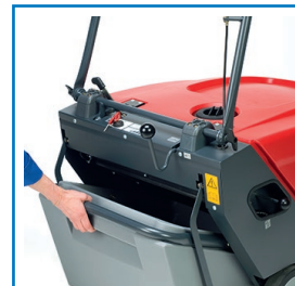
Easy removal of dirt container