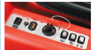
Clear control panel