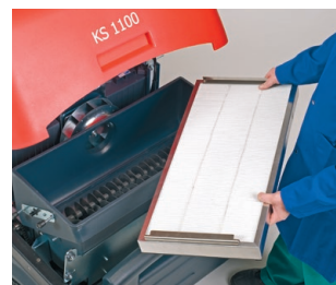
Quick filter change