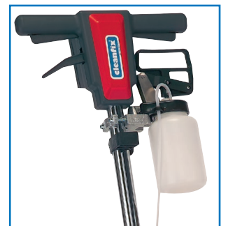
Optional: Spraymaster 1 liter