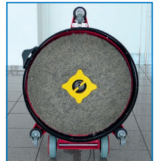
Machine with integrated driving disc