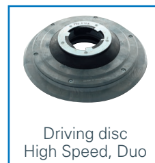
Driving disc High Speed, Duo