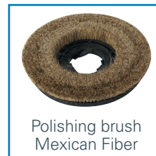
Polishing brush Mexican Fiber