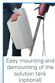
Easy mounting and demounting of the solution tank (optional)