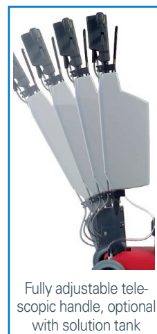
Fully adjustable telescopic handle, optional with solution tank