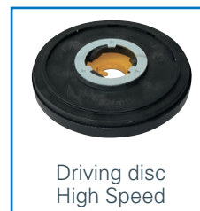
Driving disc High Speed