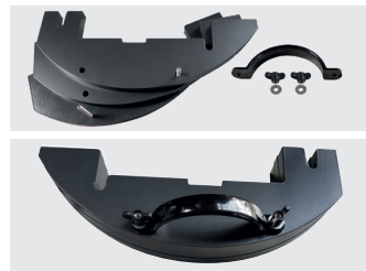
Weights easily adaptable (special accessories)