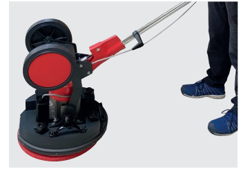
Turn the handle completely upside down to get maximum weight on the ground