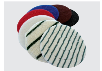
Large selection of pads