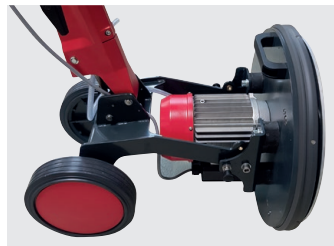
Brush head set up for optimal storage