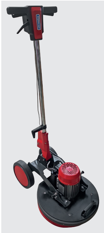
E44 Excenter Scope of delivery

Our patented handle adjustment as well as the large transport wheels for easy transportation are great advantages. Also useful are the two detents (750.586 kit detent pins) on the body that allow you to either lift the wheels off the ground to leave no running marks or turn the handle completely upside down to get maximum weight on the ground. By adding additional weights in pieces, you can perfectly adapt the machine weight to your application. Simply set up the brush head of the E44 Excenter and you can easily change the pads or store the machine.