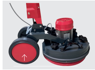
lift the wheels off the ground to leave no running marks