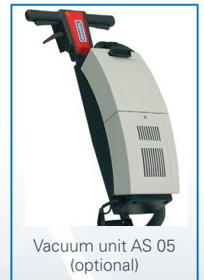
Vacuum unit AS 05 (optional)