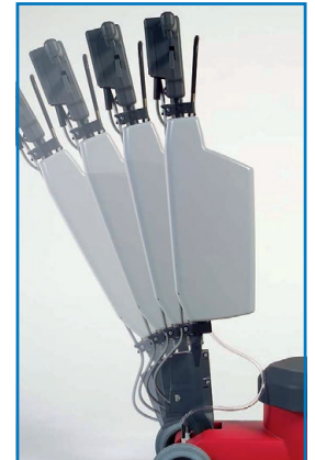
Fully adjustable telescopic handle, optional with solution tank