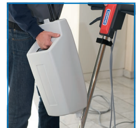
Easy mounting and demounting of the solution tank (optional)