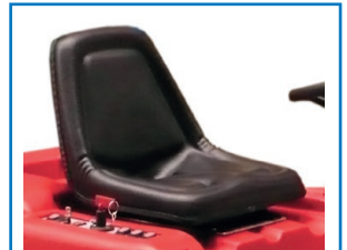
Adjustable ergonomic seat