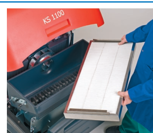
Quick filter change