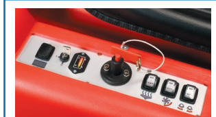
Clear control panel