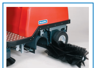
Easy to change the brushes