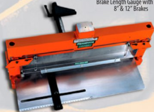
Brake Table with Scale & Squaring Arm 12" Brake Only