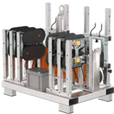
TRANSPORT FRAME Easy to transport (optional)