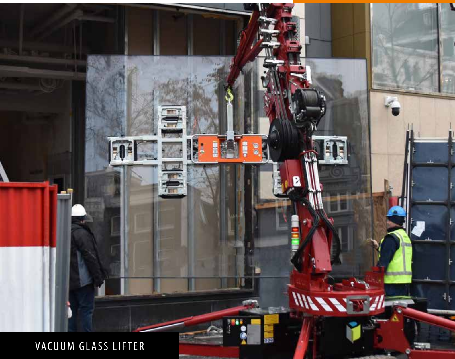
VACUUM GLASS LIFTER

FLAT GLASS LIFTING AND PLACING UP TO 1.000 KG