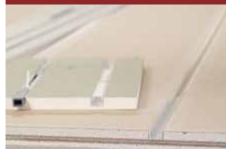
Rectangular grooves for LED profiles (15 - 25 mm wide)