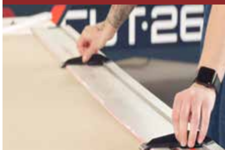
Precise positioning of guide rails