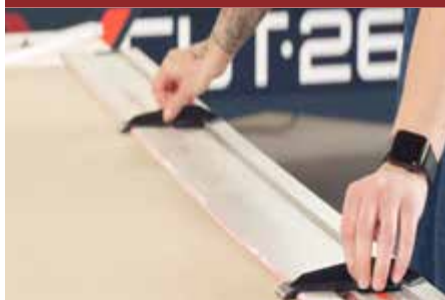
Precise positioning of guide rails