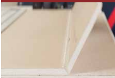
V-shaped grooves for folding/bending technology (90° + 45°)