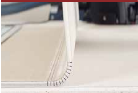
Up to 4 cuts in a single pass