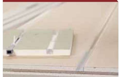
Rectangular grooves for LED profiles (15 - 25 mm wide)