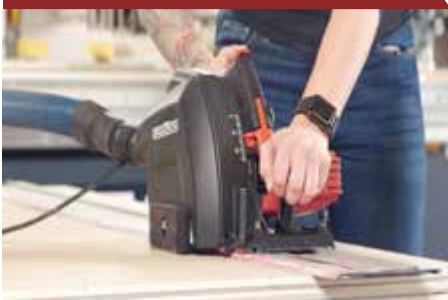
Cutting and sawing depth up to 26 mm