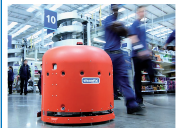
Shopping Mall with obstacles 60 min / 800 – 1000 m 2