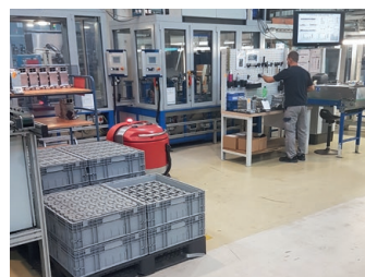
Environments with obstacles 60 min / 700 – 800m 2