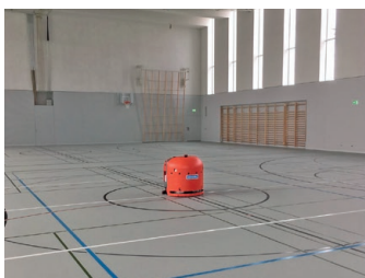
Sports halls without obstacles 60 min / 1400 m 2

RA660 Navi is suitable for thorough and consistent cleaning of supermarkets, shopping malls, open space offices, showrooms, large corridors, factory buildings, warehouses, halls and large airport spaces.